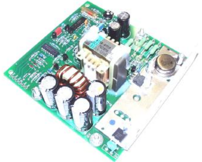
Fig. 1 (shows SDC 60/30-12 without the hot melt glue)

The module should be fixed at the heat sink and the opposite edges of the PCB; an elastic mounting is highly recommended. The efficiency of the heat sink must be sufficient. The contacts (INPUT+, OUTPUT+ and GND/RET) are realized by metric stud bolts (diameter: 4mm). The feedthroughs are intended for the signal contacts.